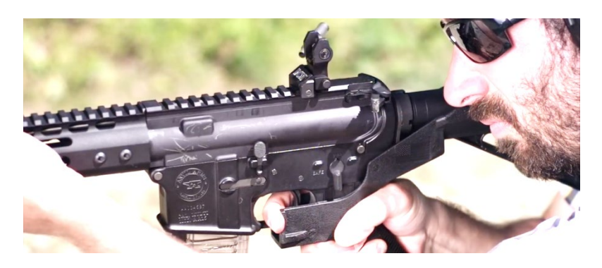
Photograph Two: Trigger comes into contact with stationary index finger.

Photograph One: Trigger separates from stationary index finger.