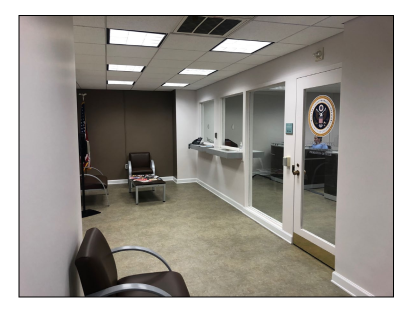
4.3 – Photo View of existing conditions at Room 2214

4.2 – Diagram of locations of Room 2214 in the Prettyman Courthouse